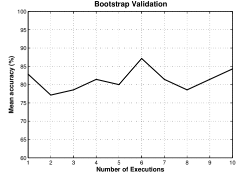
Fig. 3. Bootstrap validation by using 10 executions.

The feature selection methods attempt to select a subset of features, which produces a good description of the entire